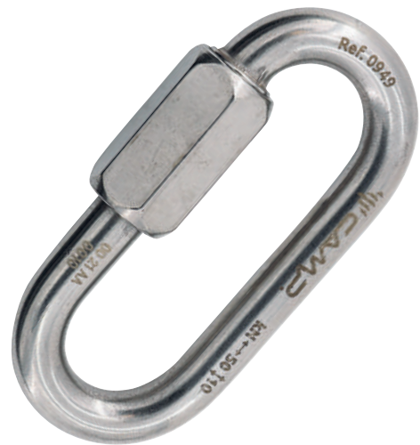
Oval Quick Link Stainless 0939 Ø 8 mm

From stainless steel for outdoor installations or corrosive environments.