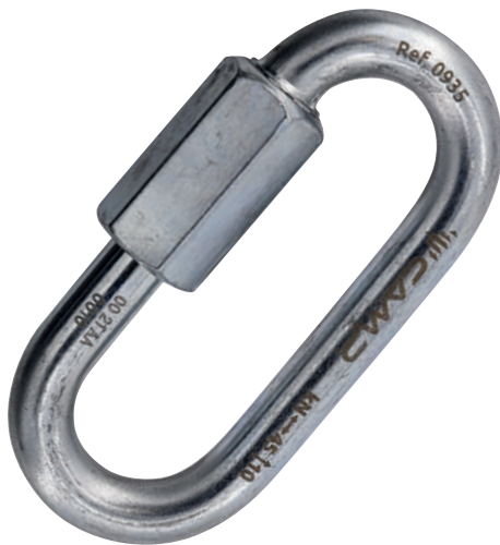
Oval Quick Link Steel 0934 Ø 8 mm

Oval quick links for high strength fixed connections.