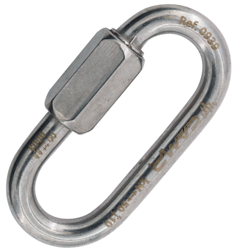
Oval Quick Link Stainless 0949 Ø 10 mm

From stainless steel for outdoor installations or corrosive environments.