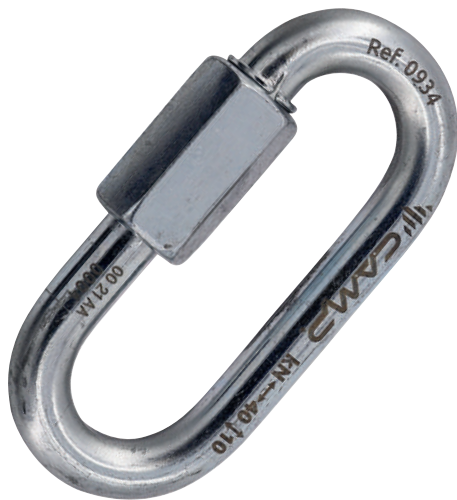
Oval Quick Link Steel 0935 Ø 10 mm

Oval quick links for high strength fixed connections.