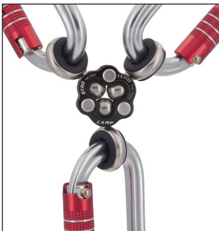
Three removeable silicon anti-rotation inserts